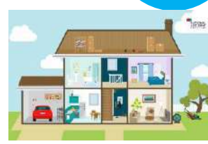
In the Home