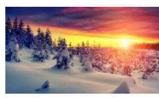
Living in the Arctic