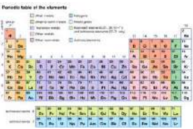
The Periodic table