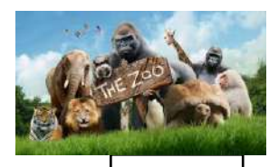
At the Zoo